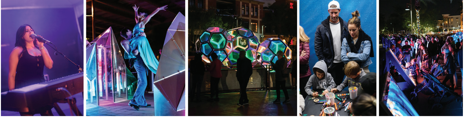
Canal Convergence 2024.

Your passion for art and generous support as a sponsor of Canal Convergence has a resounding ripple effect on the community, providing enriching exposure to world-class art to thousands of residents and visitors of Scottsdale.