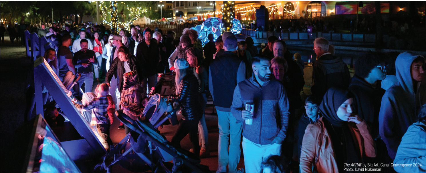
The ARRAY by Big Art, Canal Convergence 2024.