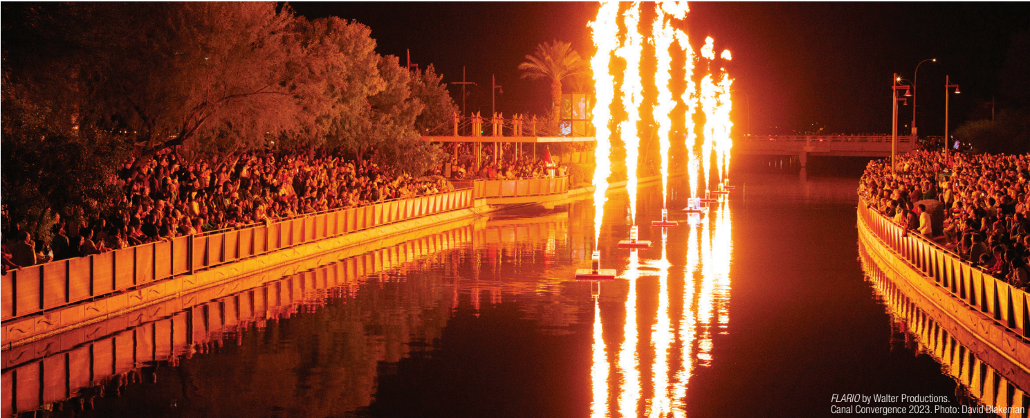
FLARIO by Walter Productions. Canal Convergence 2023.

Additional event metrics data available upon request.