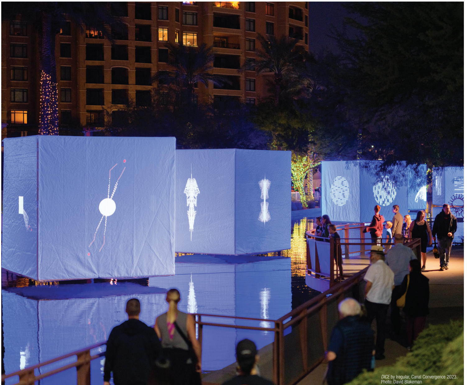
DICE by Iregular, Canal Convergence 2023.