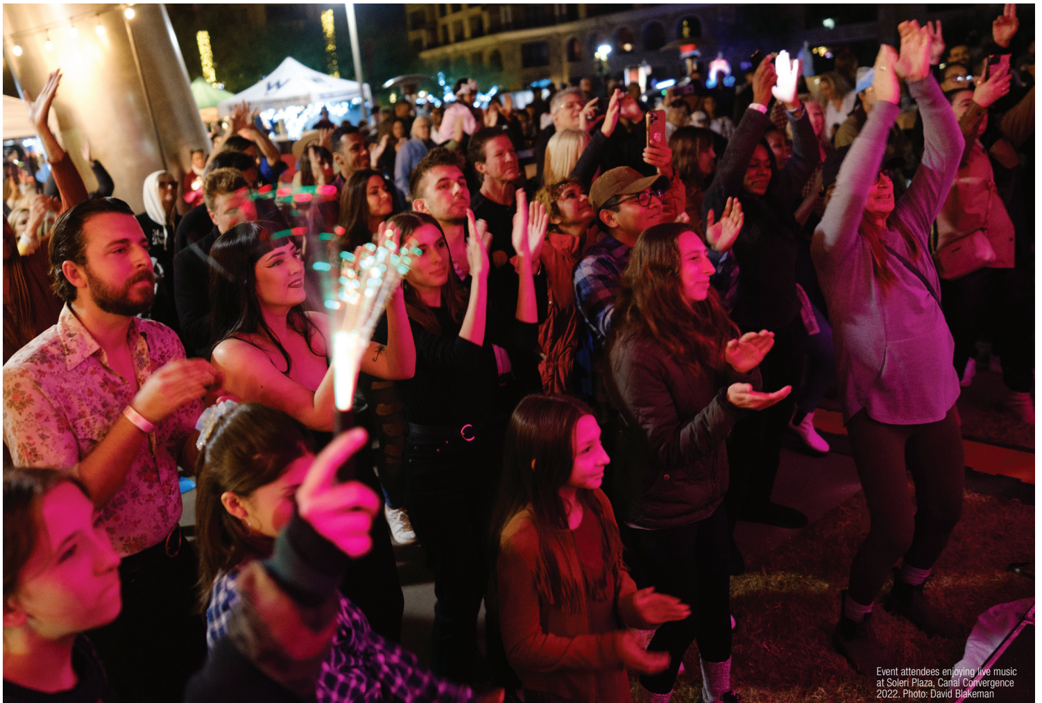
Event attendees enjoying live music at Soler Plaza, Canal Convergence 2022.