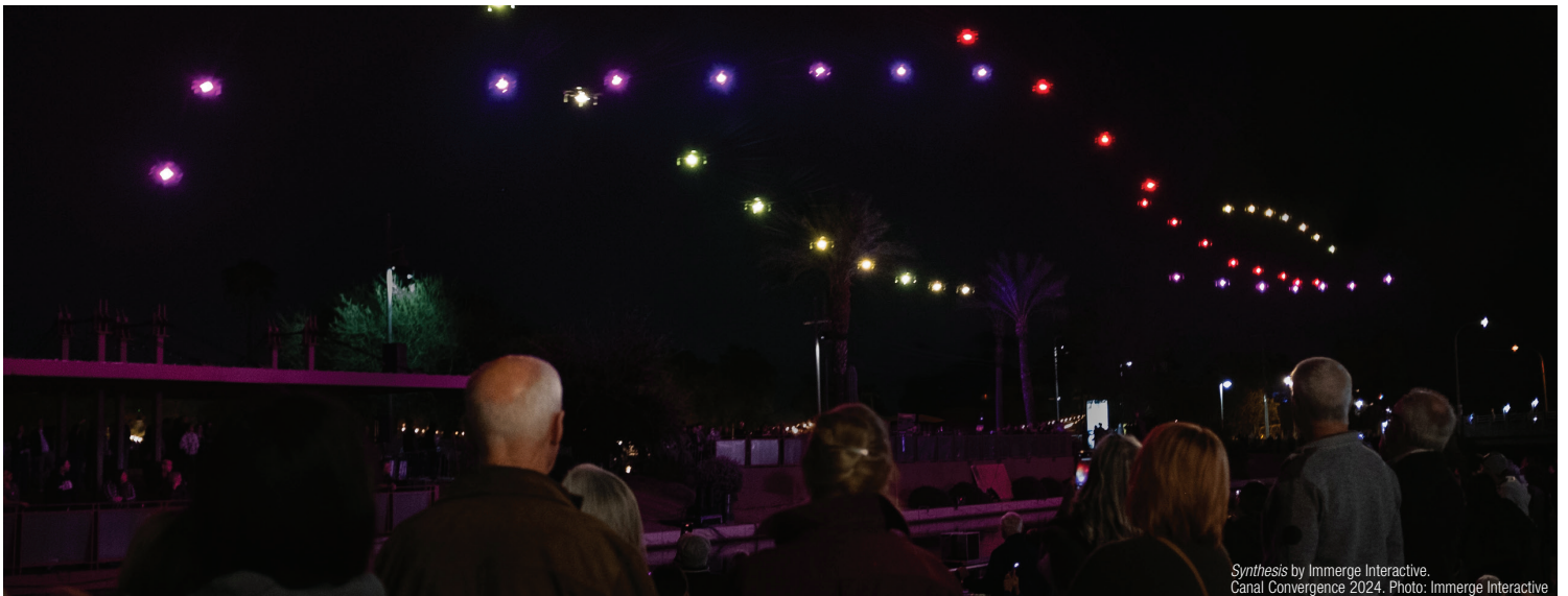
Synthesis by Immerge Interactive. Canal Convergence 2024.